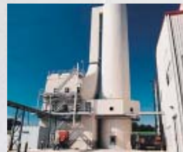
Scrubber and electrostatic precipitator for E-Glass

NOx generation is minimized at the design stage by paying attention to details of the combustion system, the insulation level and the hot-sealing of the furnace.