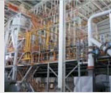
Recuperative furnace melting E-Glass, performing at 65 metric tonnes/day (72 US tons/day)

TECO pioneered the use of recuperators in conjunction with E-Glass melting. The use of special steels and refinements to the design allows the recuperators to be successfully used on furnaces to melt E-Glass, allowing higher melting rates and more efficient energy consumption. Apart from the recuperator itself, the whole combustion system is designed to suit the melting of E-Glass, with special hot-air burners for either oil or natural gas and furnace pressure control as an intrinsic part of the system.